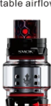
Adjustable Airflow Ring

Rotate the bottom adjustable airflow system to control air input.